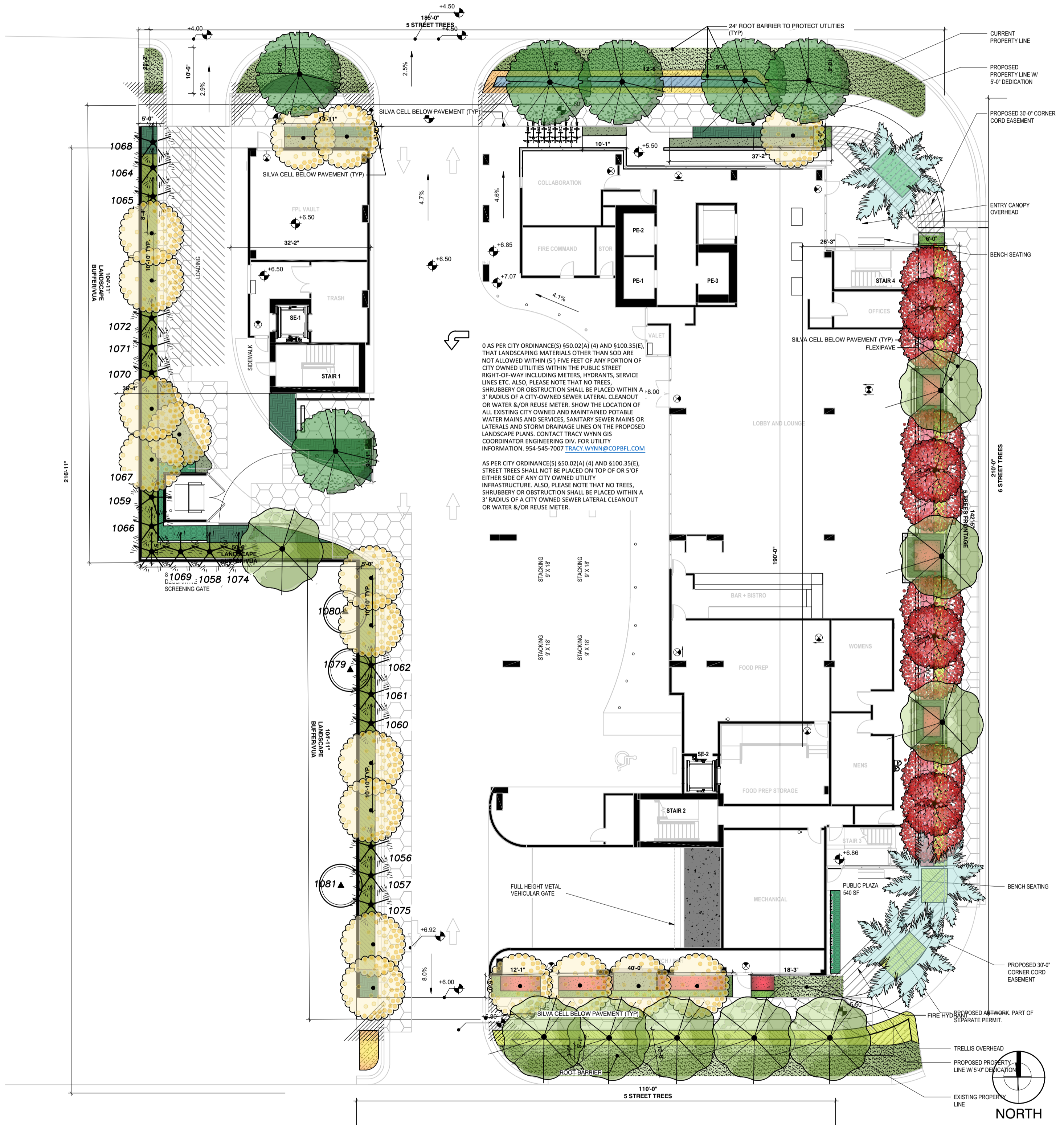
LANDSCAPE RENDERING SCALE: NTS GRAPHIC REPRESENTATION ONLY NOT FOR CONSTRUCTION